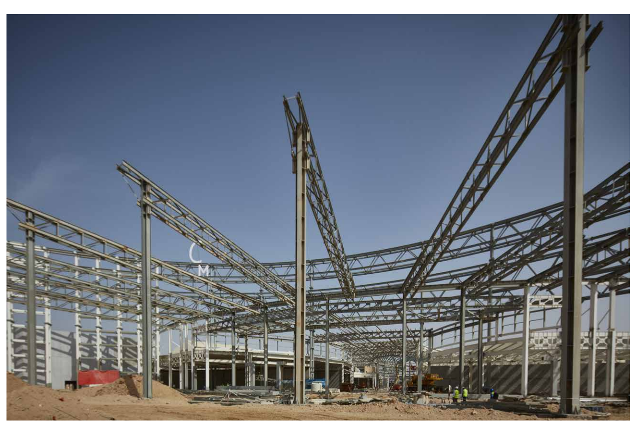
Steel construction and application of passive fire protection in Dubai

There are no material changes to the Group's opportunities and risks in comparison with the 2018 financial year. We therefore refer you to the detailed report published in the 2018 Annual Report.